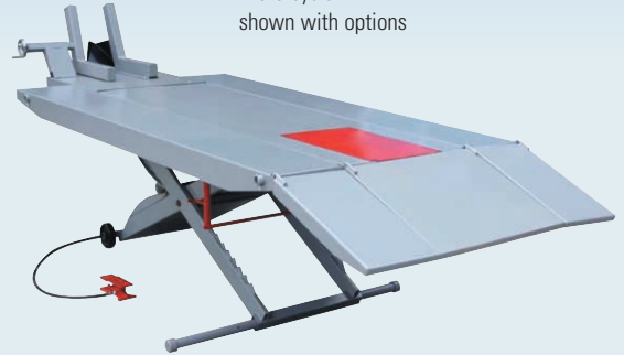
M-1000C Motorcycle lift shown with options