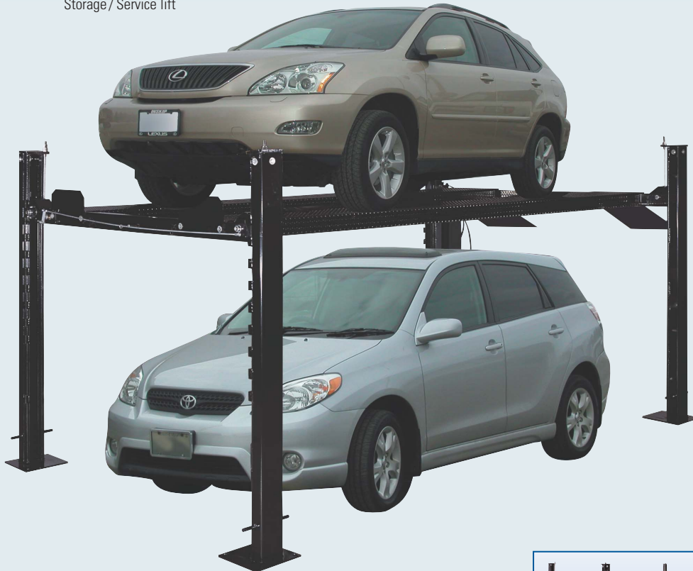
FP7K Storage/ Service lift

7,000 lb./ 9,000 lb. capacity and large 3" cylinder, one-piece diamond-plate runways and scratch-resistant powder coat paint.